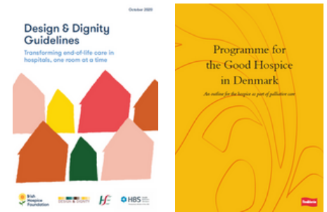
Examples of international design guidance examined during the consultation. Left: Design & Dignity Guidelines (2020). Right: Programme for the Good Hospice in Denmark (2007).

Budgets and running costs were a key focus of discussions, with advice for how to create adaptable, energy-efficient projects seen as crucial to ensuring success and sustainability in the long term.